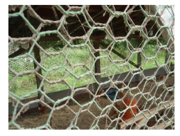
Example of doubled up 2cm (or larger) mesh

Please clean the feed bowl and the water-drinking equipment, such as the water cup. Confirm the state of the feed bowl each feeding and if you find the excrement of a wild animal, please clean it out.