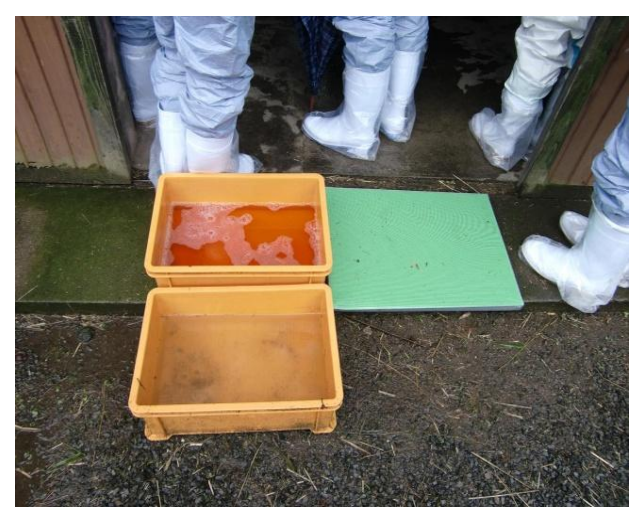
Footwear Sterilization Tub