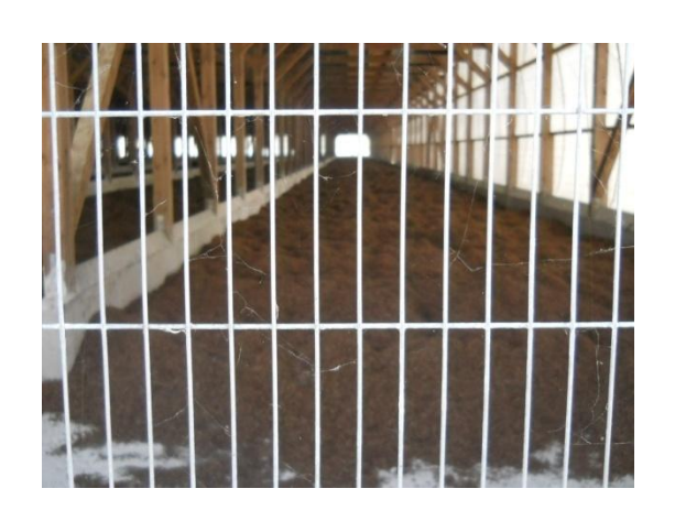
An example of using narrow wire mesh to prevent invasion by small birds