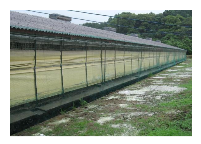
Bird nets surrounding the entire chicken coop.