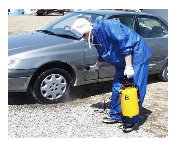
Clean Vehicles By Using Sterilization Pump