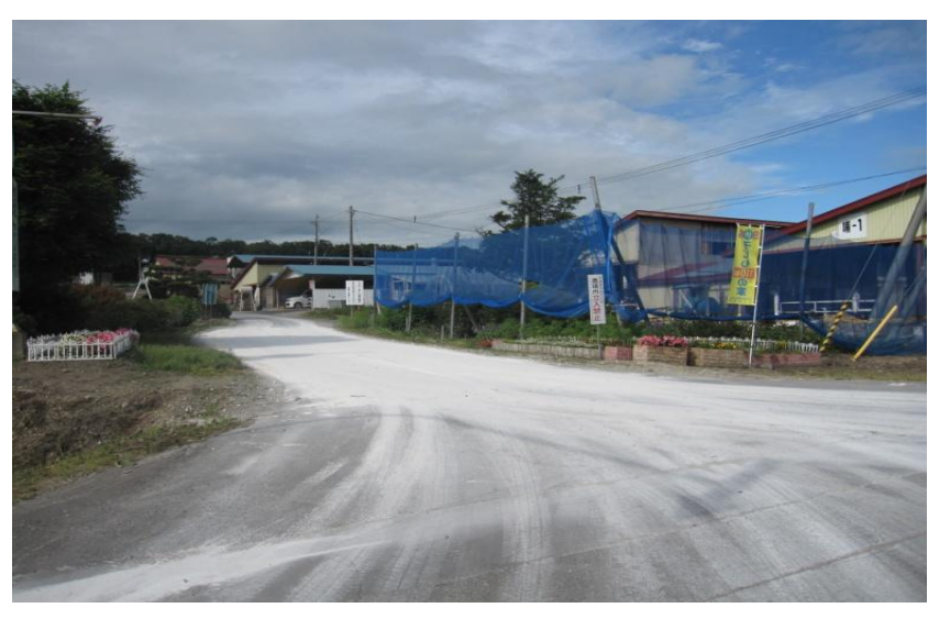
Farm Entrance Scattered With Slaked Lime