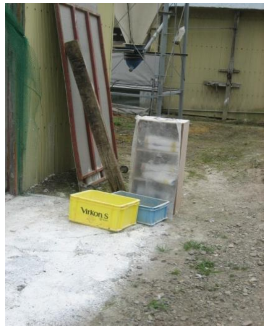
Location of clothing (white coats) and rubber boots for use in Hygiene Managed Areas/inside coops (Example)