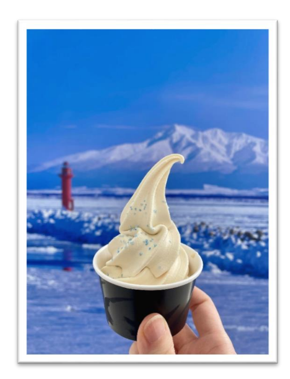
▲ Ice cream with blue salt crystals at the Okhotsk Drift Ice Museum

Traveling to different parts of Hokkaido usually takes several hours even by the fastest train, but now that I had experienced my first regional flights, the prefecture felt much smaller. I was able to fly from Sapporo to a far end of the island and back with sightseeing in the middle, all within a regular workday's time.