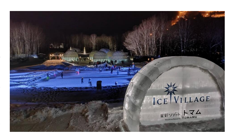
▲ Ice Village in Tomamu

There are so many that I find it so hard to choose one! I think the most memorable had to be our first winter here when my daughter and I went on a trip to Tomamu. We visited the ice village, had drinks in an ice dome, watched fireworks, went winter horseriding, tried riding on a snowmobile and even made our own Baumkuchen over a fire in a teepee. It was an experience of a lifetime and we bonded over the creation of many first experiences in our lives.