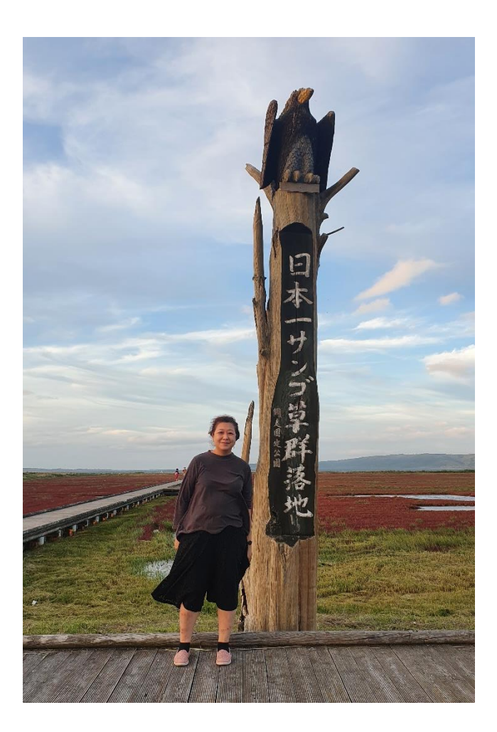
▲ Lake Notoro in autumn when the glasswort turned red