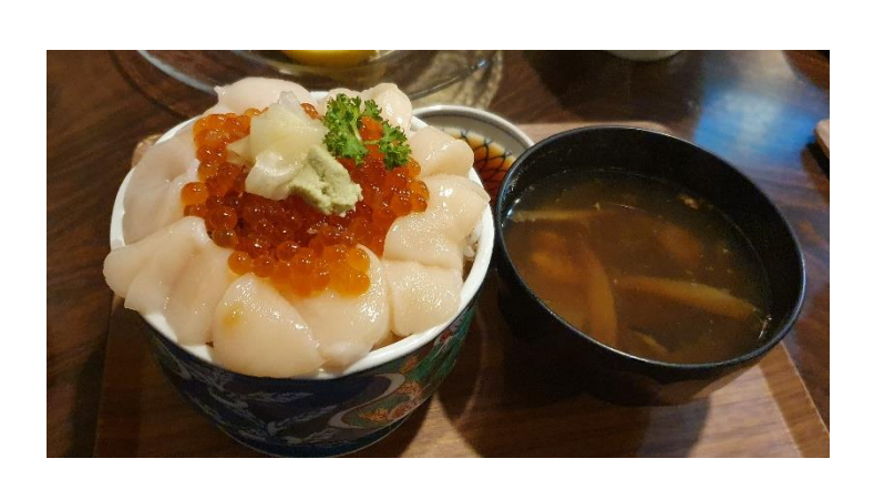
Scallop and salmon roe rice bowl at Matsu Sushi, an eatery in Tokoro Town

Other interesting things which I love in the region would be the drift ice festival in Abashiri in winter, where you can see many ice sculptures made by the locals and the glasswort at Lake Notoro in September. The entire lake just turns into a sea of varying degrees of red.